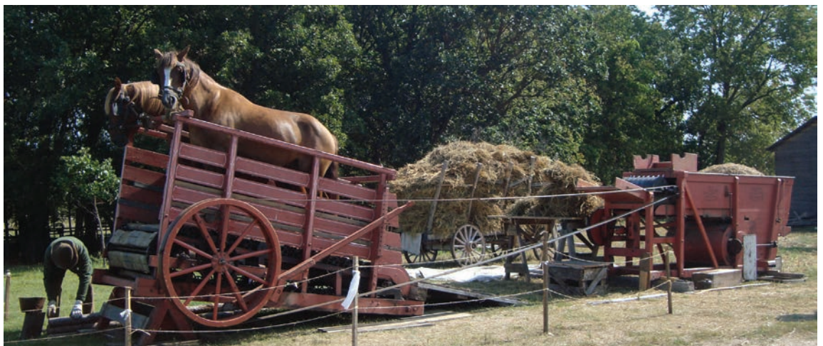
Horses on the treadmill power the threshing machine.

The staff has survived as well, and moved into fall school programs. New fall activities like shocking corn, processing sorghum, digging potatoes, and baking gingerbread have replaced summer weeding and watering, watering, watering!