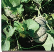
Jenny Lind melon.

Early horse cultivation and some slick "modern" weeding have helped produce a marginal corn crop, one that is