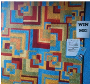
You could win this quilt!

Tickets are $2/each and can be sold in packets of 10. Last year we raised $556 dollars through the raffle. Our goal this year is $600.